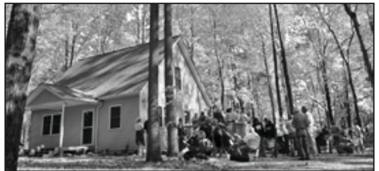
▼ Friends and family look on during the dedication ceremony.